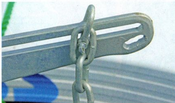
Note the long slot in the shank to which the shackle is attached for use in reef or rocky areas.

ability to correctly and quickly set into strata once in contact with the bottom. This is due to the specially designed half circle section that turns the anchor upon contact so that the concave fluke can quickly dig into the bottom and make fast. The idea is to use sufficient chain drop to facilitate the process if one intends to consistently anchor in areas where current is expected to be swift flowing.