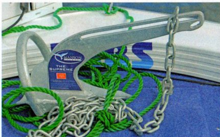
A close look at the Supreme 5lb anchor – one mighty rugged pick.

Manson's Supreme is claimed to have extra strong holding capability plus the